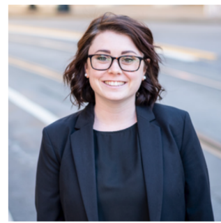
EL HAYNES ATLANTA, GA