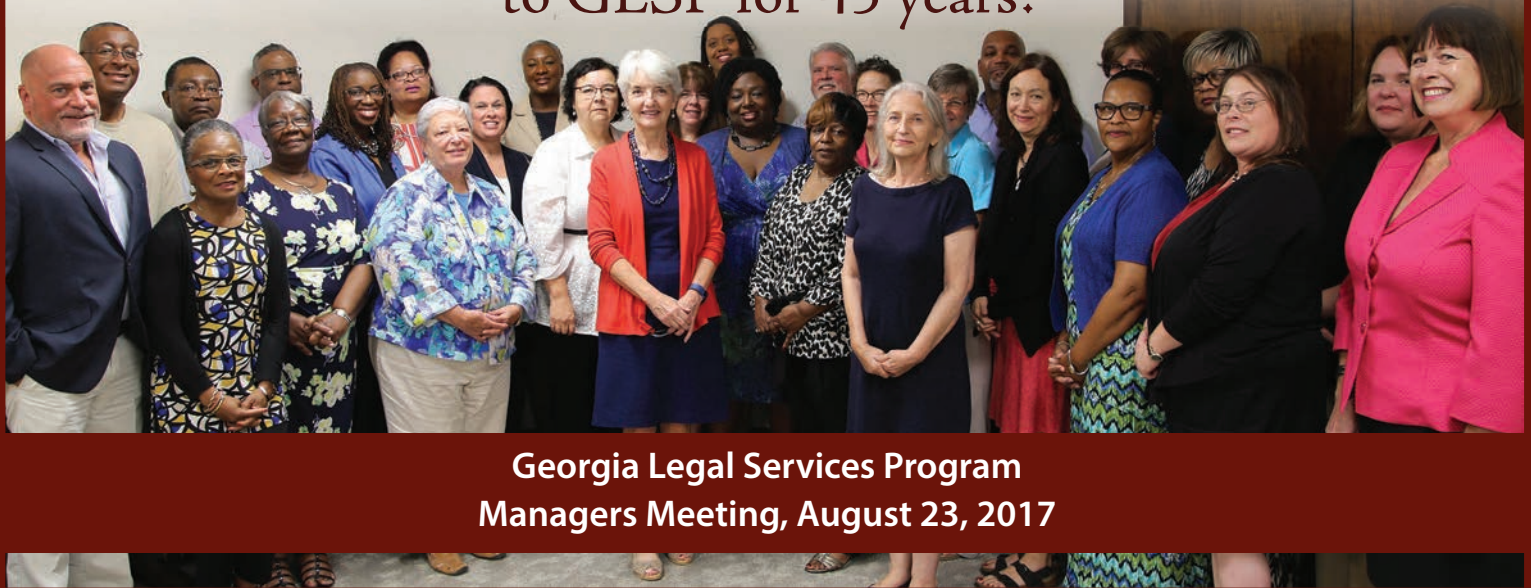
Georgia Legal Services Program Managers Meeting, August 23, 2017